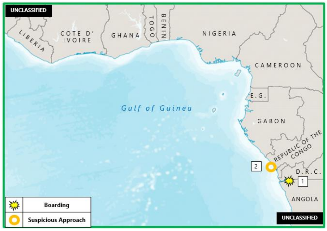
Figure 2. West Africa – Gulf of Guinea Piracy and Maritime Crime