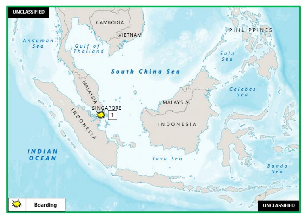
Figure 4. East Asia – Southeast Asia - Piracy and Maritime Crime