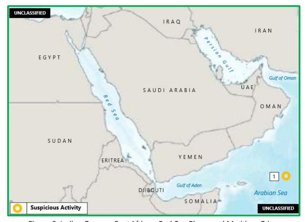
Figure 3. Indian Ocean – East Africa – Red Sea Piracy and Maritime Crime

1. (U) ARABIAN SEA: On 5 May, 0630 local time, an underway tanker reported a suspicious approach by two small boats each with four persons onboard, approximately 335 NM east of Socotra, Yemen, near position 13:19N – 060:14E. The two small boats approached to within a half NM of the tanker while a larger vessel and small crafts were also seen nearby. The tanker increased her speed and the small boats eventually left the area. The crew were reported safe and the tanker continued her voyage. (UKMTO; Clearwater Dynamics; Dryad Global).